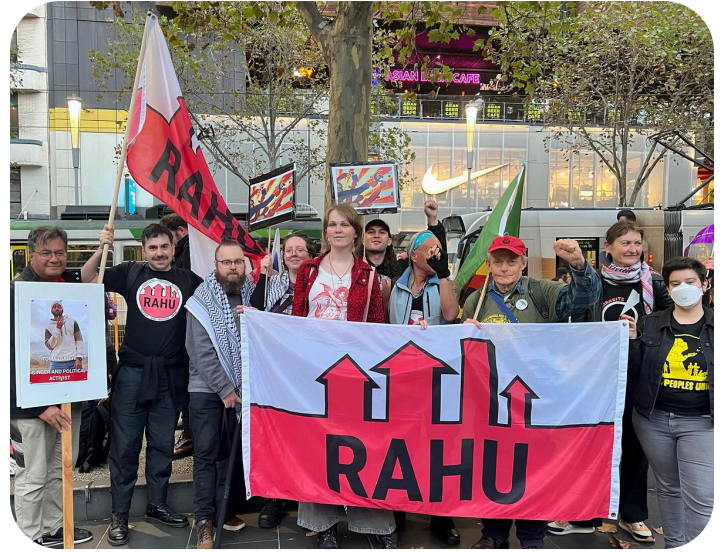
RAHU members standing united at May Day 2024

Our committees and branches saw increased participation, indicating sustainable growth and a commitment to democratic principles. Overall, the financial year ending in June 2024 was characterized by substantial progress, record membership growth, and a strong foundation for continued advocacy and community building in the face of ongoing social challenges.