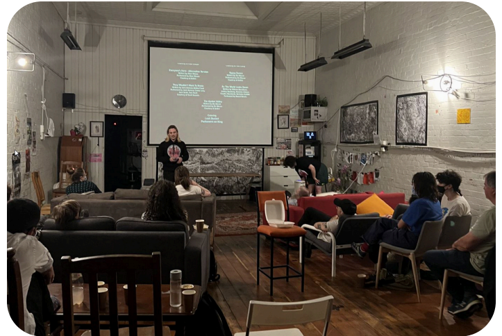
RAHU Screening of Evicted: A Modern Romance (November 2023)

We also joined forces with the energy co-operative CoPower to support community owned affordable electricity and climate change initiatives.