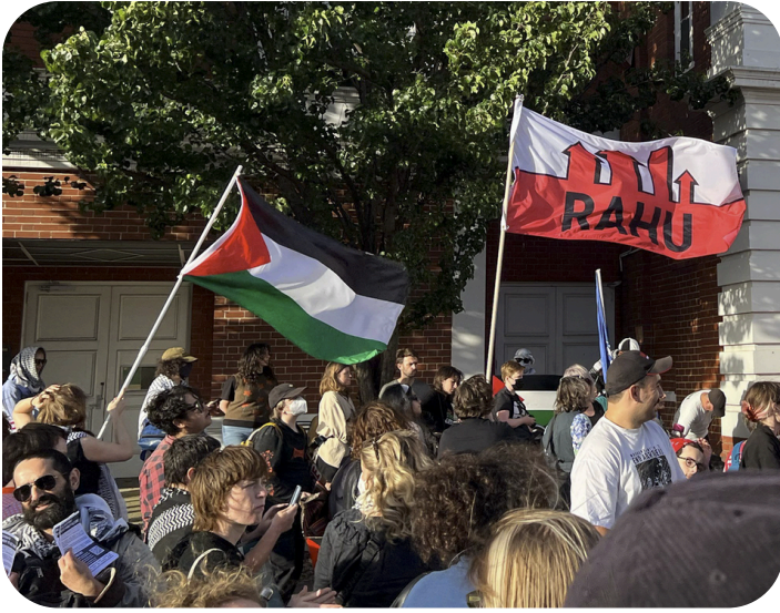
RAHU members marching for justice at a local Palestine Rally in January 2024