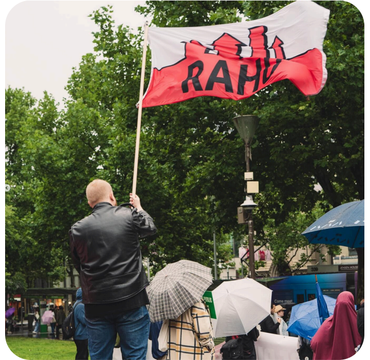
RAHU member waving RAHU flag high at National Day of Action - Housing Justice (December 2023)

As a grassroots, member-led union, we saw a sharp rise in member involvement and organizational capacity. Members stepped up to address critical issues such as disability rights, queer justice, anti-fascist action, mutual aid, and eviction defence.