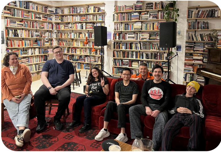
Local RAHU branch meeting (North Branch October 2023)

office bearers, ensuring that our leaders are supported as they dedicate their time and energy to our cause with less burn out. In addition, we expanded our team with new delegates and branches, strengthening our presence and reach. Our campaigns and policy team actively engaged in lobbying efforts at both the state and federal levels, advocating for improved renting rights and public housing.